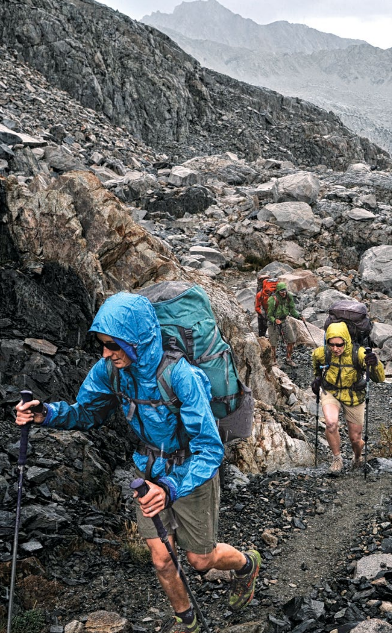
Backpackers on the John Muir Trail during a two-week trek of the Sierra High Route. Kings Canyon National Park, California.